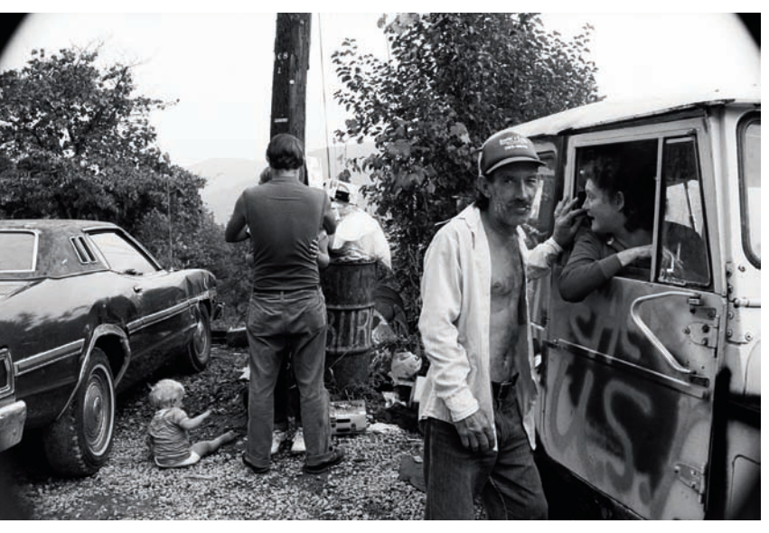
1987 This part of Kentucky is "dry" but there is clandestine partying, with moonshine and pot

'Mabel, one of Junior's sisters, lives with the Boggs family – miner Red and their 10 red-haired, timid sons – in a ramshackle wooden cabin on the edge of a ravine. No water, no electricity, and the toilet a wooden hut with a hole in the ground.'